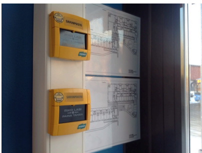
Manual smoke extraction activation