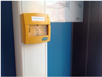
Air-conditioning emergency stop button