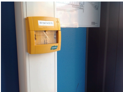
Air-conditioning emergency stop button