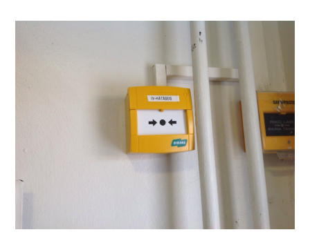
Air-conditioning emergency stop button