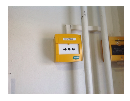
Air-conditioning emergency stop button

In every apartment staircase at the outside door