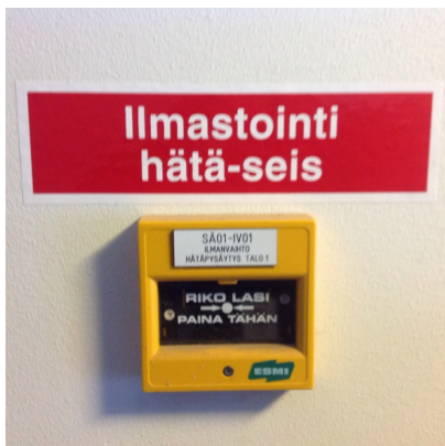
Air-conditioning emergency stop button