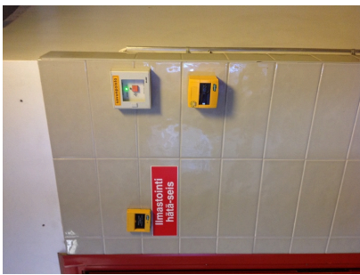
Savunpoistonlaukaisu ja il- mastoinnin hätäseis