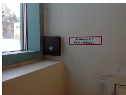
Manual smoke extraction activation