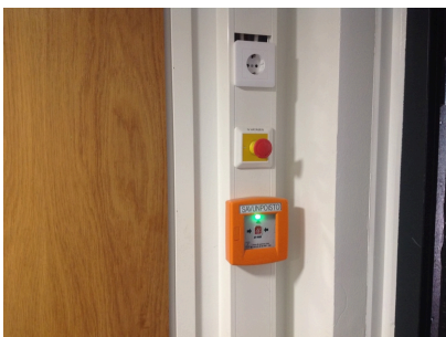
IV emergency stop and smoke extraction triggering