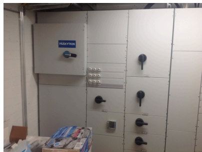
Electrical main switch