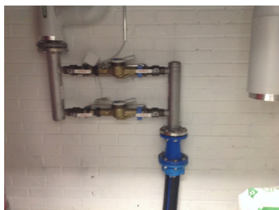
Water inlet shut-off