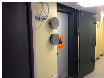
Access to the public shelter