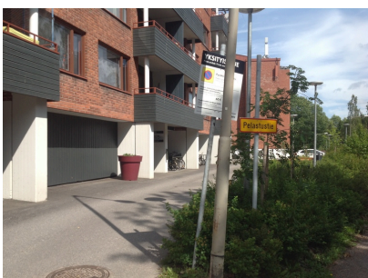
Escape routes marked

On the side of Jämeräntäival Street, in front of the houses