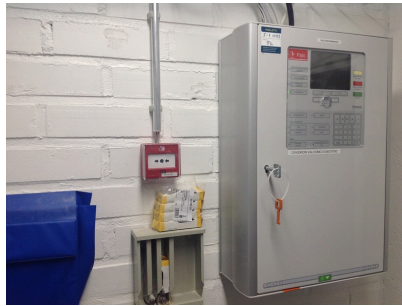
Fire alarm centre