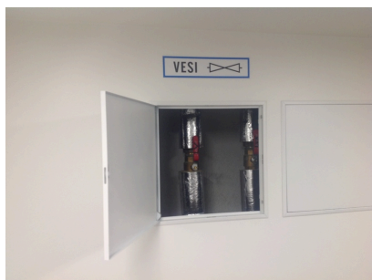
Water trap B-porras