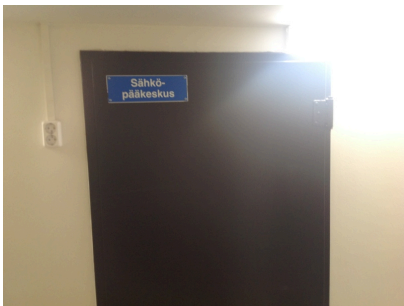
Access to the main electricity board (F-pora)