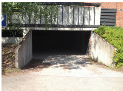
Driving to the garage