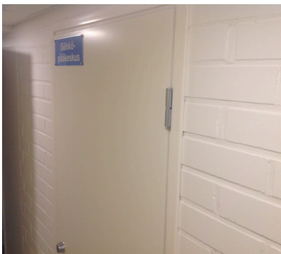
Access to the main electric wash (G-porus)