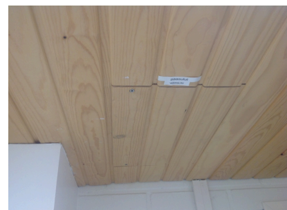
Water shut-off G-porras