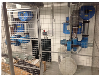
Public protection equipment