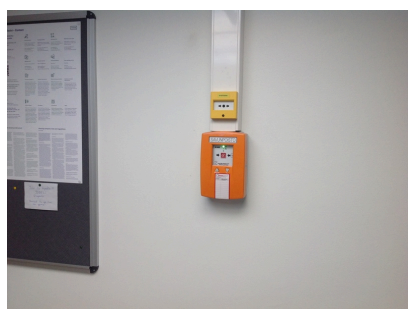
IV-hätäseis ja savunpoiston laukaisu