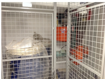
Väestönsuojan laitteisto häk- kivarastossa