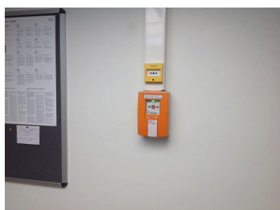
IV-hätäseis ja savunpoiston laukaisu

Ventilation emergency stop: A, B ja C-portaiden sisäänkäyntien yhteydessä.