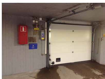
Alkusammutin ja nosto-ovi