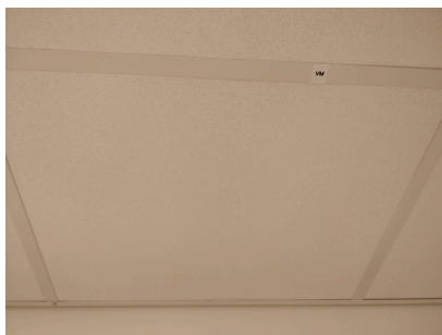
Apartment-specific water seal in the ceiling