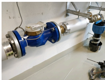
Main water seal in the heat exchange plant room