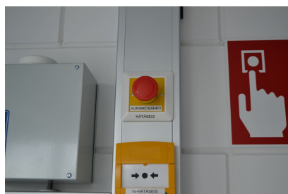
Solar power emergency shutdown

NOTE: In this case, the solar panels as well as the cabling inside the building remain live, but no longer feed the building's main centre. NOTE: With both methods OFF, the solar panels as well as the cables from the panels to the PV system's main centre remain live! IN PRACTICE, THE SYSTEM IS ALWAYS LIVE WHEN IT RECEIVES LIGHT.