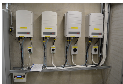
Solar power inverters