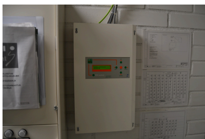
Safety light panel