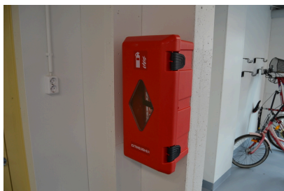
A portable fire extinguisher in the storage area for bikes