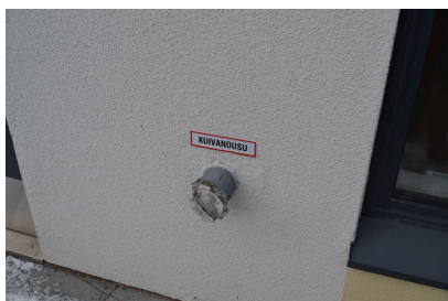
Dry rise supply connector