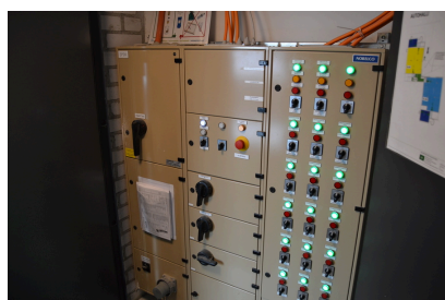
Smoke extraction activation panel