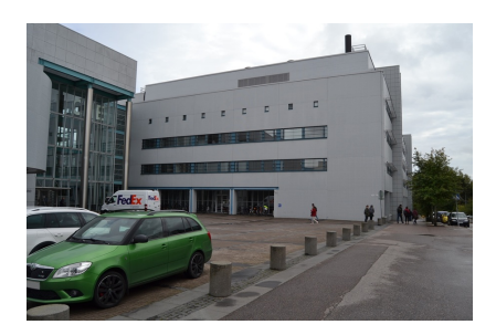
Back-up gathering area

Back-up gathering area: Specified when needed