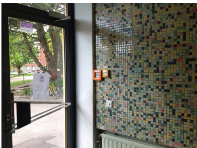
Air-conditioning emergency stop and smoke extraction activation switches at the entrances