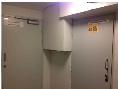
Access into the main electrical switchboard and heat distribution room from staircase A