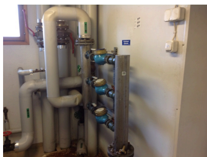
The main water cut-off valve in the heat distribution room