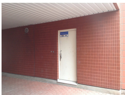
Access into the heat distribution room