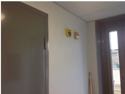
Air-conditioning emergency stop and smoke extraction activation switches at the entrances