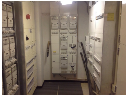
Main electrical switchboard in basement A