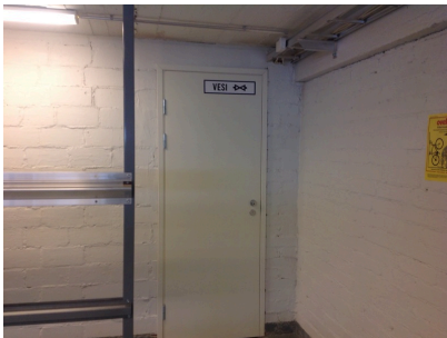
Access to the main water stopcock