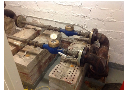
Main water stopcock in basement A