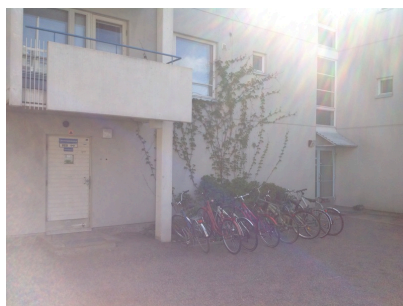
The access into the technical areas is signposted