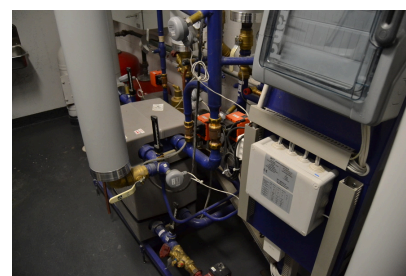
The appliances of the heat distribution room