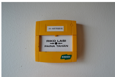
Air-conditioning emergency stop button