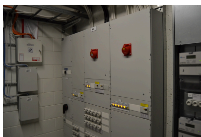
The apparatus of the main electrical switchboard