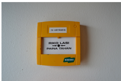
Air-conditioning emergency stop button

Ventilation emergency stop: By staircase, at the exterior doors