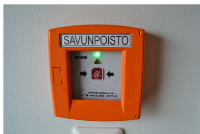
Smoke extraction activation