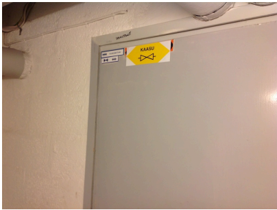
Access to the main cut-offs of the water and gas