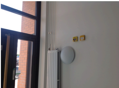
Air-conditioning emergency stop and smoke extraction activation switches at the entrances