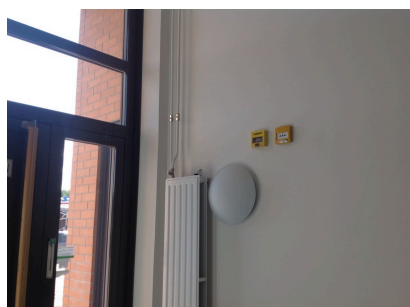
Air-conditioning emergency stop and smoke extraction activation switches at the entrances

Ventilation emergency stop: At the entrances