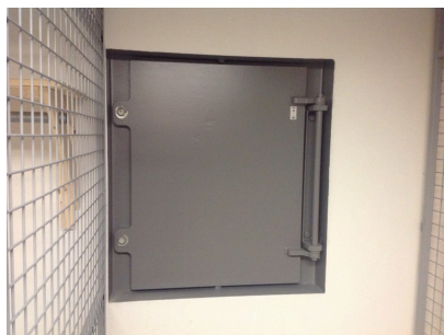
Emergency exit from the civil defence shelter