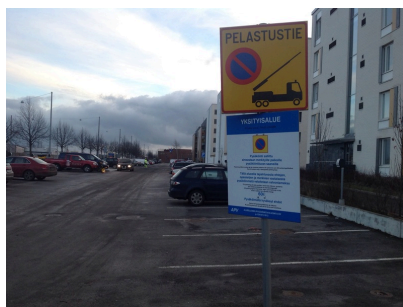
Fire service access from Haukilahdenkuja 13.