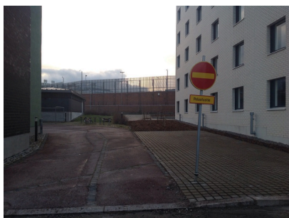
Fire service access adjacent to building C.