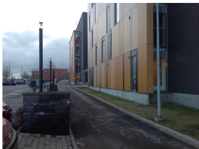
Front of Muurikuja 1.

Gathering area: In front of Muurikuja 1.