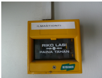
Air-conditioning emergency stop