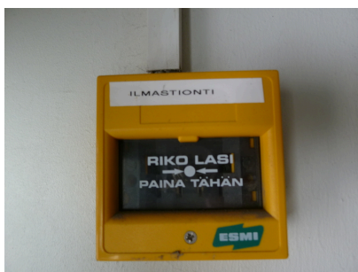
Air-conditioning emergency stop