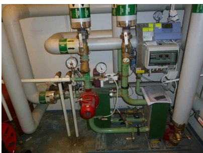
Heat distribution room.