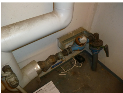
The main water stopcock