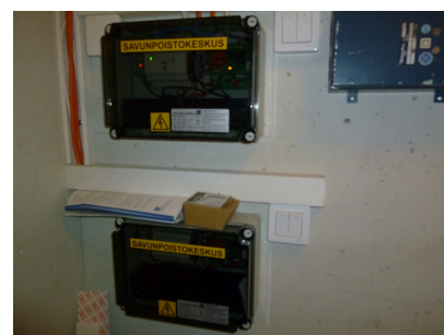
Smoke extraction panel