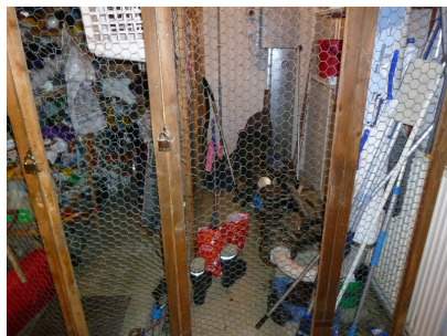
Main water stopcock, cage