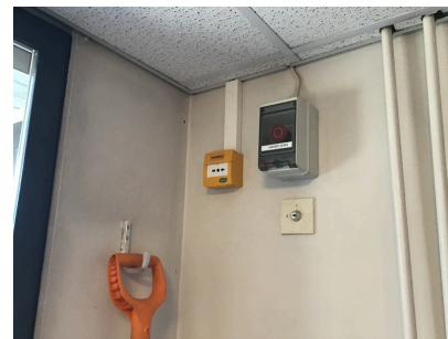
Savunpoiston etälaukaisu ja ilmanvaihdon hätä-seis-painike