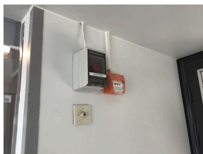
Savunpoisto etälaukaisu ja ilmanvaihdon hätä-seis-painike