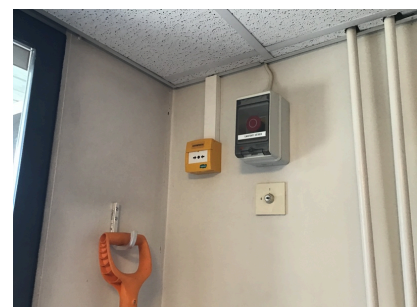
Savunpoiston etälaukaisu ja ilmanvaihdon hätä-seis-painike