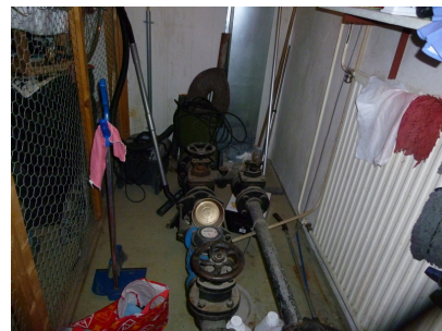
The main water stopcock