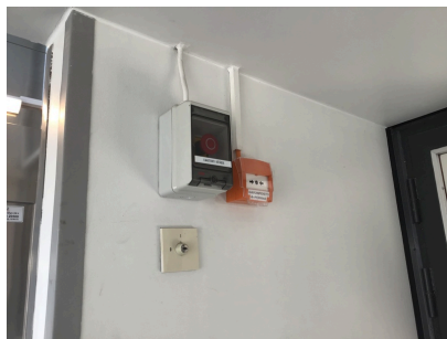
Savunpoisto etälaukaisu ja ilmanvaihdon hätä-seis-painike