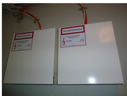
Smoke extraction panel