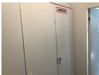
Kulku AB ja EF talojen sähkö-pääkeskukseen