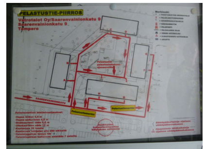
Rescue route diagram