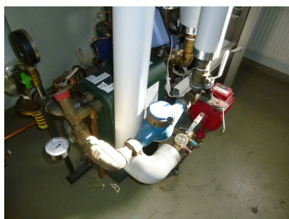
Water stopcock of building A, heat distribution room