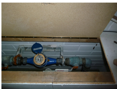
Main water stopcock, building B