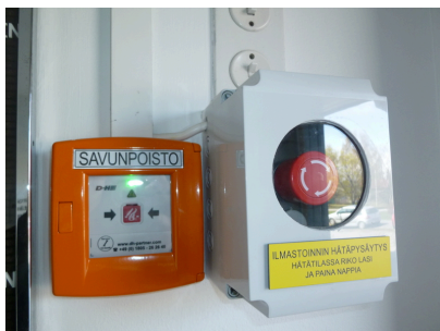
Manual smoke extraction activation