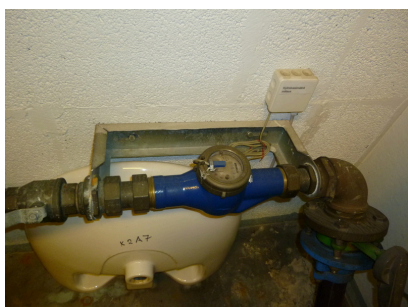
The main water stopcock