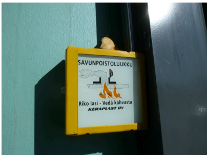
Manual smoke extraction activation