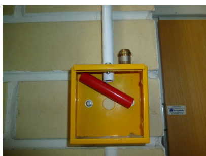
Manual smoke extraction activation