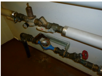
The main water stopcock