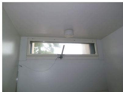
Smoke extraction hatch