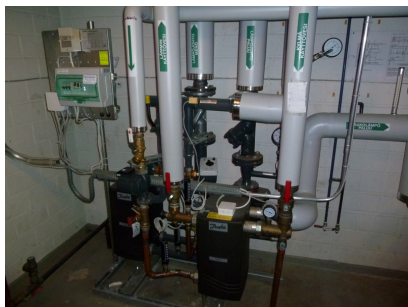
Heat distribution room.