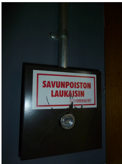
Manual smoke extraction activation