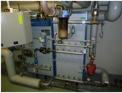
Heat distribution room.