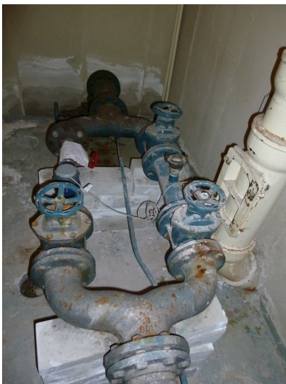
The main water stopcock