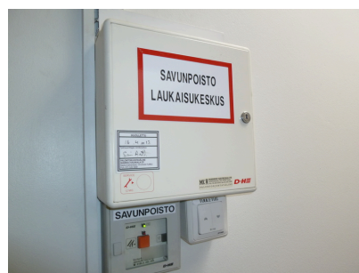
Smoke extraction activation panel