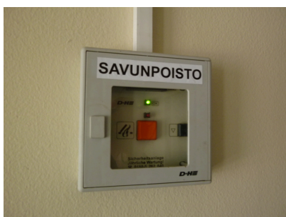
Manual smoke extraction activation