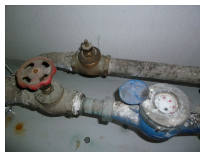
Main water stopcock, Suoniemenkatu 4