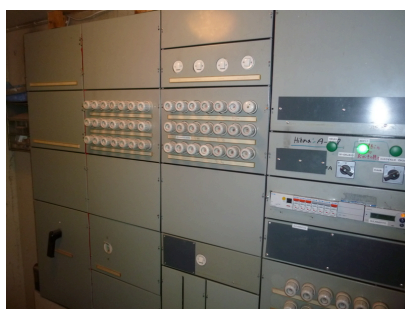
Main electrical switchboard, Suoniemenkatu 4