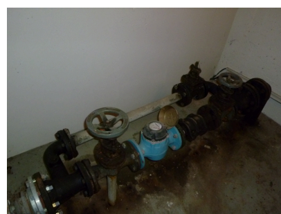
Main water stopcock, Suoniemenkatu 2