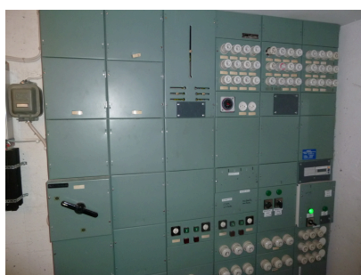
Main electrical switchboard, Suoniemenkatu 2