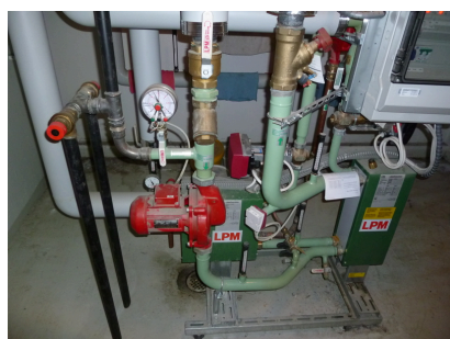
Heat distribution room, Suoniemenkatu 4