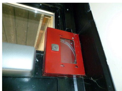
Manual smoke extraction activation