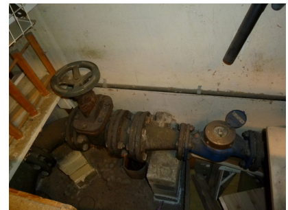
The main water stopcock