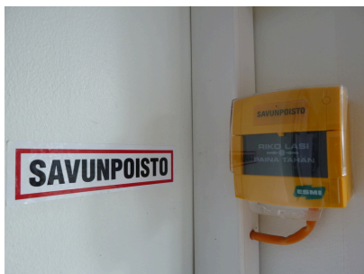
Manual smoke extraction activation