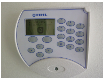
Fire alarm switchboard