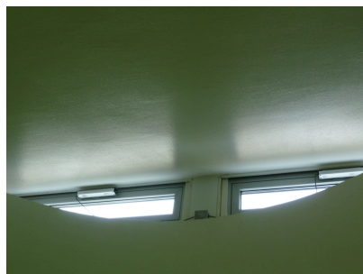
Smoke extraction hatch