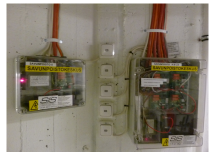
Smoke extraction panel