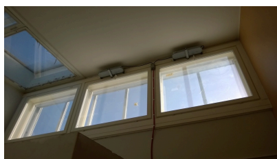
Smoke extraction hatch