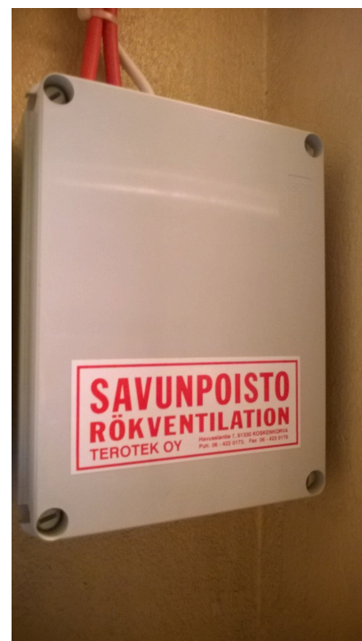
Smoke extraction panel