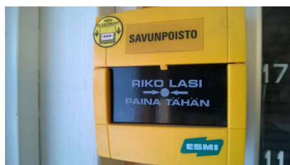
Manual smoke extraction activation