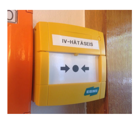
Air-conditioning emergency stop