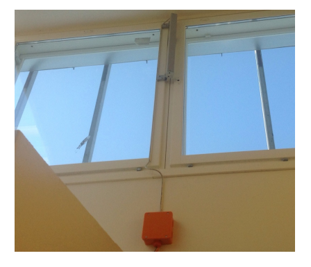
Smoke extraction window in the staircase