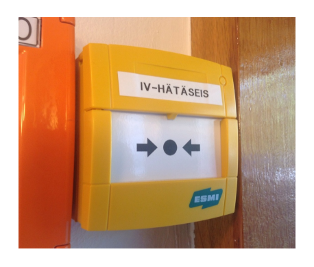
Air-conditioning emergency stop